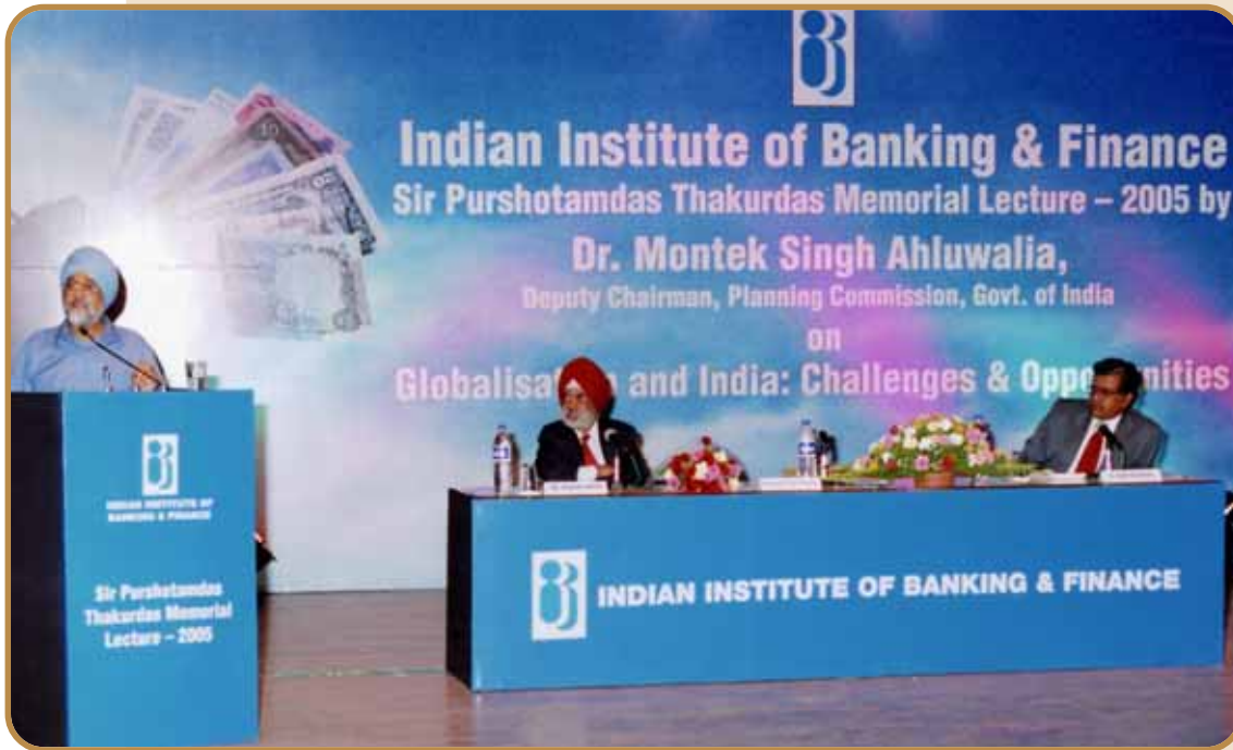
Dr. Montek Singh Ahluwalia delivering Sir PTM Lecture 2005 On 'Globalisation and India : Challenges & Opportunities