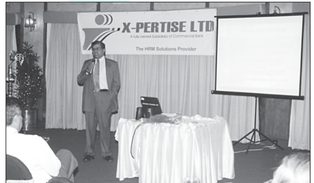
The CEO, speaks at the launch function of IIBF Banking Education programme at Colombo.

The Institute organized an exclusive Advanced Management Development Programme for the middle and senior level executives of Co-operative banks from 30-1-2006 to 4-2-2006 for six days at the IIBF Auditorium, Mumbai to sharpen skills in the key areas of Asset Liability Management, Treasury Management, Risk Management, Profitability Management, Use of Technology in banking, Soft Skills Development-HR,