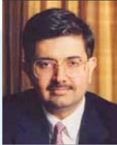
Shri Uday Kotak Executive Vice Chairman and Managing Director Kotak Mahindra Bank Ltd.