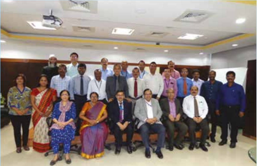
11 th Bank Executive Programme (4.11.2019 to 8.11.2019) at the Leadership Centre of the Institute in Mumbai.